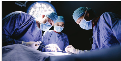
Electrosurgery Fundamentals, Function, and Safety