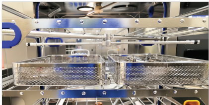
Decontam Double-Take: Focusing on Quality Assurance in the Decontamination Department